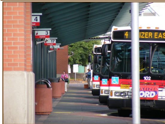
Replace and upgrade aging buses